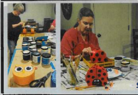
With a little creativity, the ladies transformed paving bricks into mini masterpieces - perfect for adding delightful surprises around the garden.