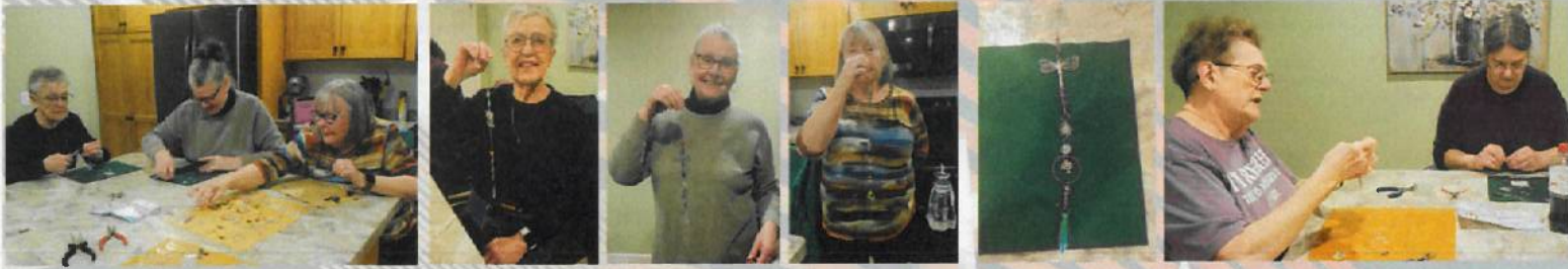
Crafting Corner success. The Suncatchers were a hit with the ladies, and their creations turned out beautifully.