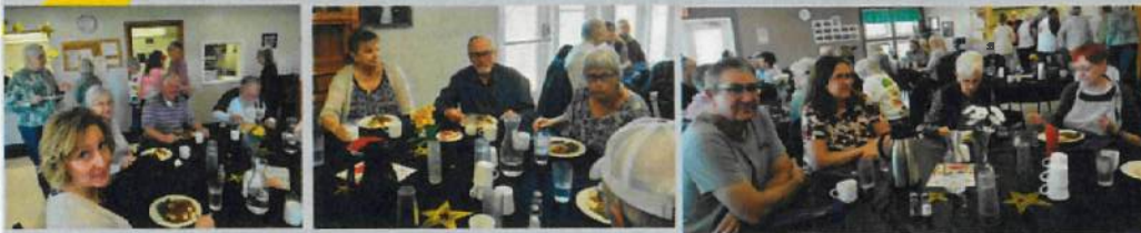
"Thank you" doesn't even begin to cover the gratitude we feel for the time you've given. Your contributions means more than words can say.